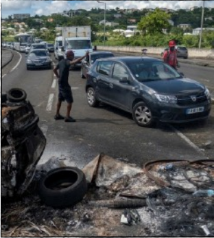
A barricade blocks the road leading to the airport, in Fort-De-France, Martinique on November 24, 2021.

For months , protests have taken place in opposition to Covid vaccine mandates. Last week the protests turned violent , with road blocks, burning, looting and attacks on police in the islands of Guadeloupe and Martinique where many homes and businesses have been destroyed. French special forces were sent from Paris to quell the violence and for now, the decision has been made to postpone the mandates.